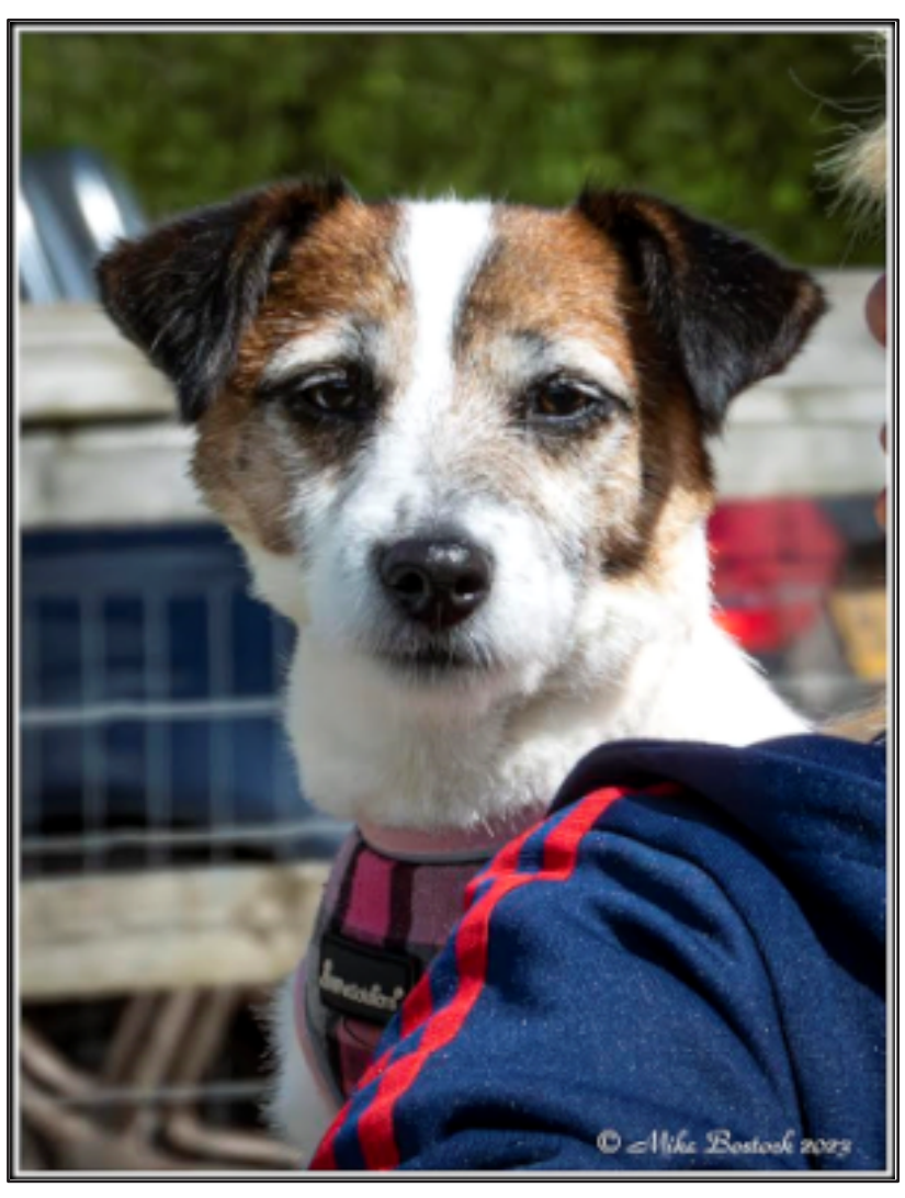
This handsome chap was pictured at the Coronation Dog Show - report and more super pictures on Page 15 & 16.

The newsletter for Zeal Monachorum and St Peter's Parish