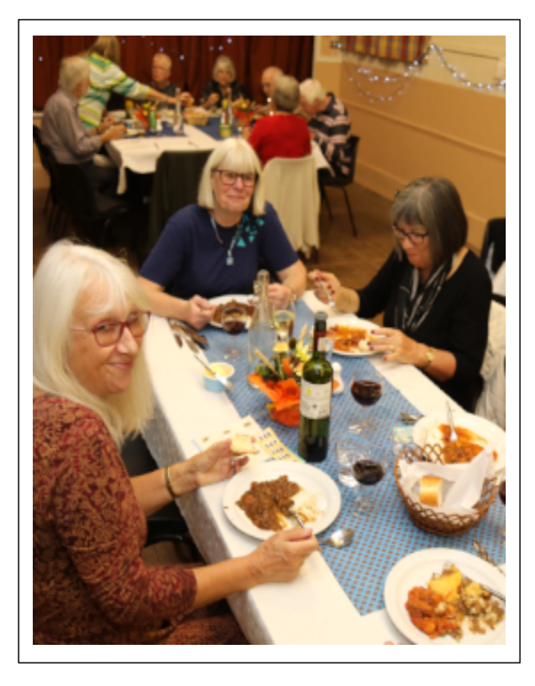
Some of the visitors enjoying the recent Harvest Supper see report on Page 4.

The newsletter for Zeal Monachorum and St Peter's Parish